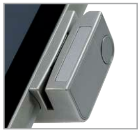
Magnetic card reader